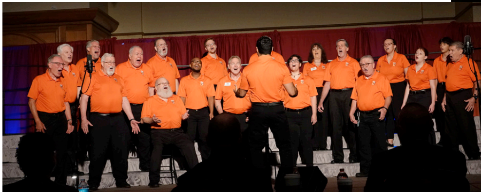
Big O sings off the trophy

Score sheets for the chorus competition are available HERE.