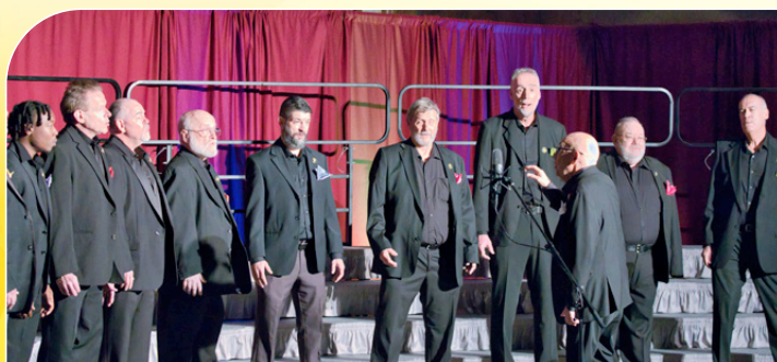
Sunshine City Chorus Sunshine District Chorus Champions — Spring Convention, 2025 —