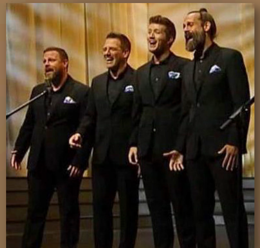
2023 International 5th Place Bronze Medalists Throwback