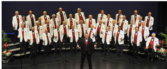
Sarasota Chorus of the Keys

The Chorus of the Keys hopes all Sunshine District members are experiencing an enjoyable summer even though we may be sheltering at times from the heat and humidity. Despite the weather conditions, the Chorus of the Keys , as usual, rehearses throughout the year and is currently working diligently on adding three new