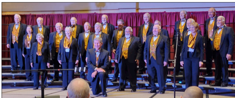
Hernando Harmonizers Hernando County, FL