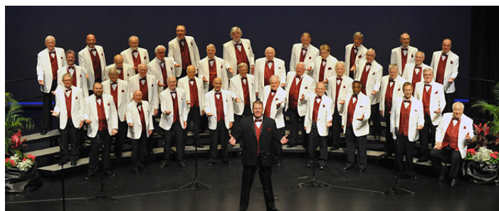
Sarasota Chorus of the Keys

Since 1999, the Sunshine District of the Barbershop Harmony Society has sponsored a three-day Summer Music Camp for Florida high school boys and girls. This summer's theme is "Rock Around the Clock" – A Tribute in Harmony to the Music of the 1950's and will feature special male and female guest quartets. www.chorusofthekeys.org