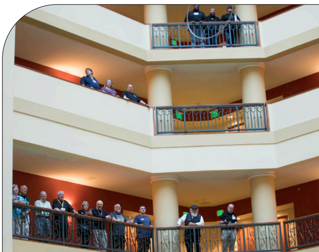
Mass Sing in the Atrium at the Spring 2023 Convention