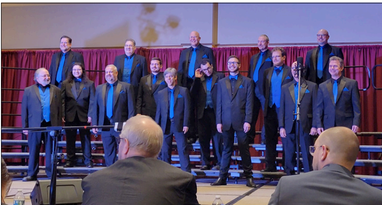
Barbergators Gainesville, FL