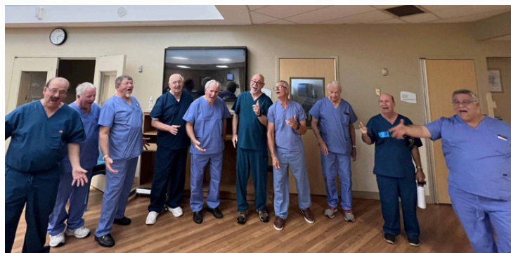
The Palm Beach Coastmen Music Medics sing for patients at JFK hospital in West Palm Beach.

shocked, in a good way, when nearly the entire chorus volunteered.