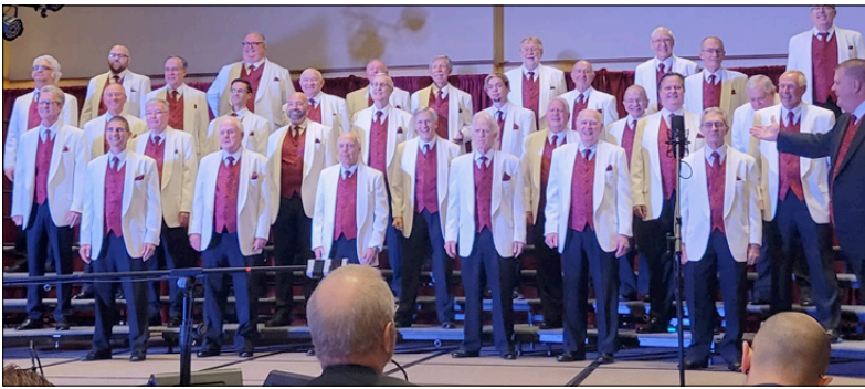
Chorus of the Keys Sarasota, FL