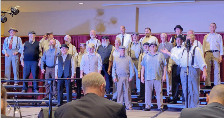
Emerald Coast Chorus Fort Walton Beach, FL