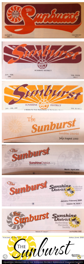
The evolution of the Sunburst masthead from 1978 to present.