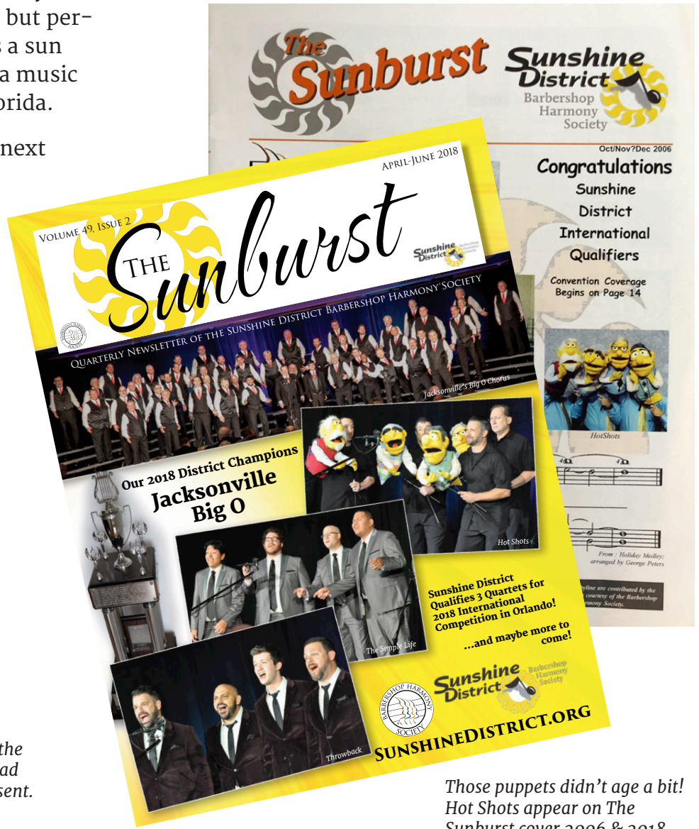
Those puppets didn't age a bit! Hot Shots appear on The Sunburst cover 2006 & 2018.

Have a fun moment captured in a photo from the past you want to share? Email editor@sunshinedistrict.org