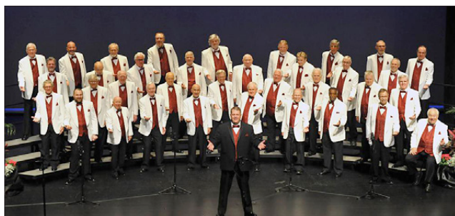
Sarasota Chorus of the Keys February 22nd Annual Show Chorus photograph

For approximately 10 months the Sarasota Chorus, in the face of the COVID-19 pandemic and technical hurdles, continues to meet each week for an evening rehearsal over Zoom.