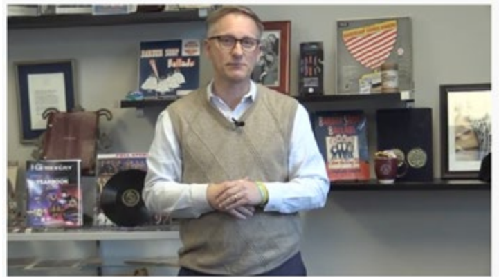
A Few Minutes with Marty | March 2020

https://www.youtube.com/watch?v=f-4-zVJ-8D1c&feature=emb_logo