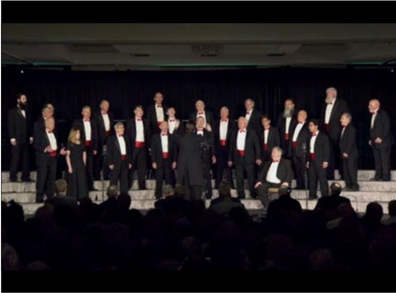
HARBOR CITY HARMONIZERS MIXED HARMONY Melbourne