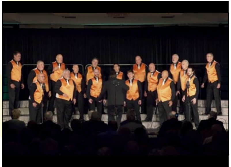
ORANGE BLOSSOM CHORUS Orlando