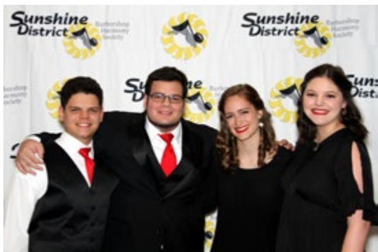
Mix It Up at the 2019 Spring Convention