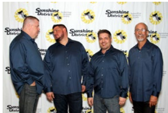
Moment's Notice at the 2019 Spring Convention