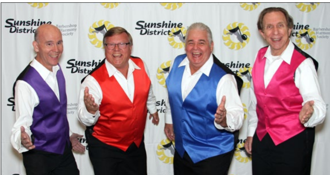
TBQ at the 2019 Spring Convention