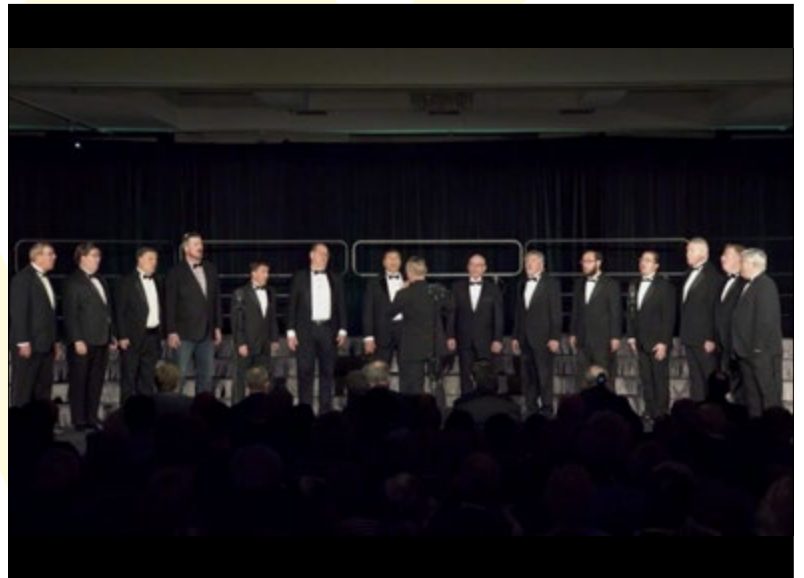
ORLANDO HARMONY Winter Park