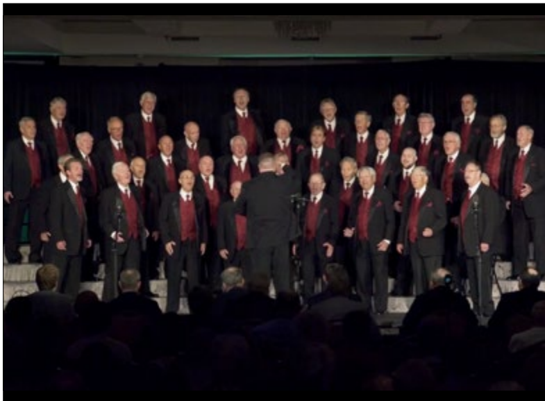
CHORUS OF THE KEYS Sarasota