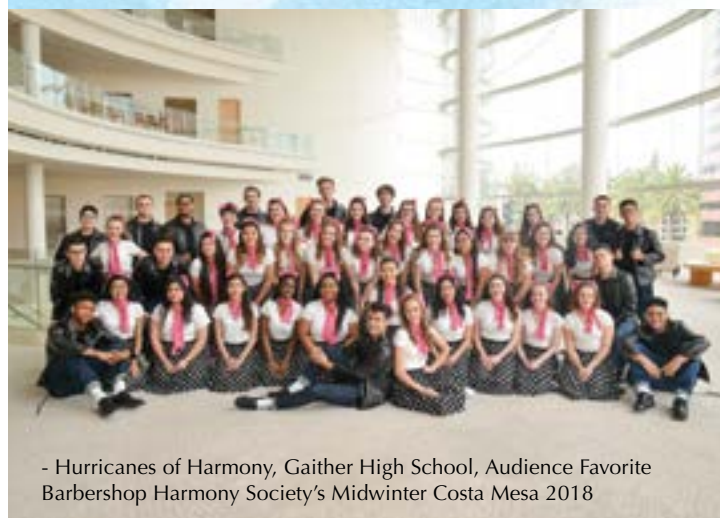
- Hurricanes of Harmony, Gaither High School, Audience Favorite Barbershop Harmony Society's Midwinter Costa Mesa 2018

Harmony Foundation is here to connect you, the singing community, to the impact partner programs that will ensure singing for generations to come.