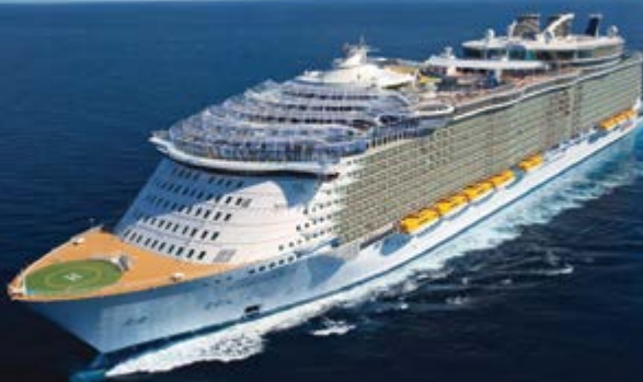
Harmony on the Harmony 2.0