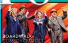
BOARDWALK COMEDY QUARTET

PREFERRED SEATING: $40 INCLUDES PRE-SHOW ARRIVE 1 HOUR PRIOR TO SHOWTIME GENERAL SEATING: $25