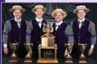
2017 Barbershop Harmony Society's International Quartet Champions