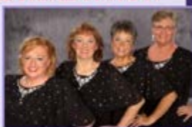
"Spirit of the Gulf" Quartet

30% of the net proceeds from these shows will help repair Hurricane Irma damage to Cypress Lake Presbyterian.