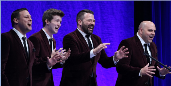
Quartets that qualified for the International Contest in July, Left to Right, Top to Bottom.