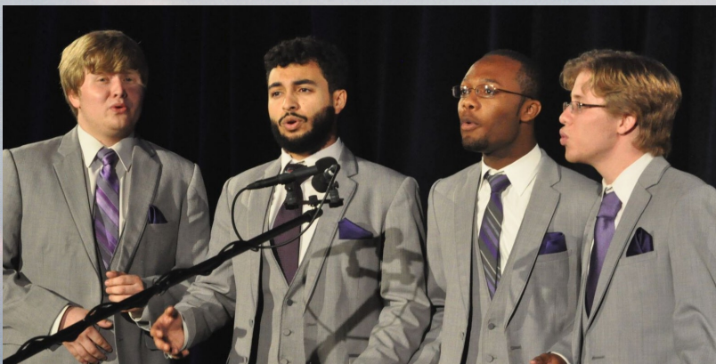
On Point 2016 Sunshine District Youth Quartet Champion