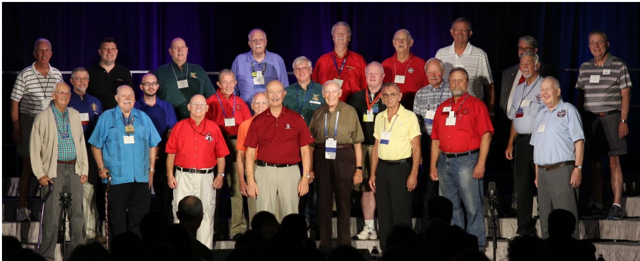
2016 MT Dick Dreger Memorial Chorus