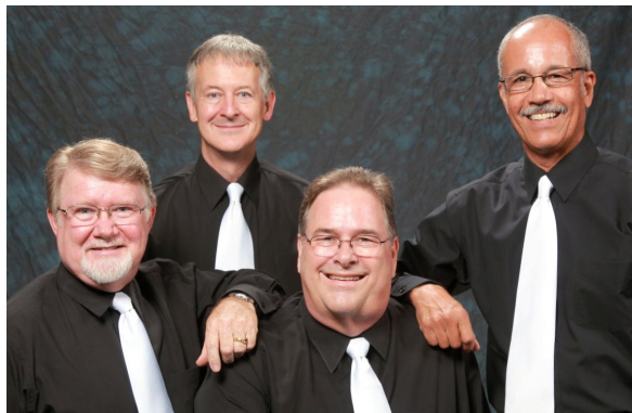
Do you know these Quartets?

President: Surfside Chorus Phone: 386-882-4274 bobstump@cfl.rr.com www.surfsidechorus.org