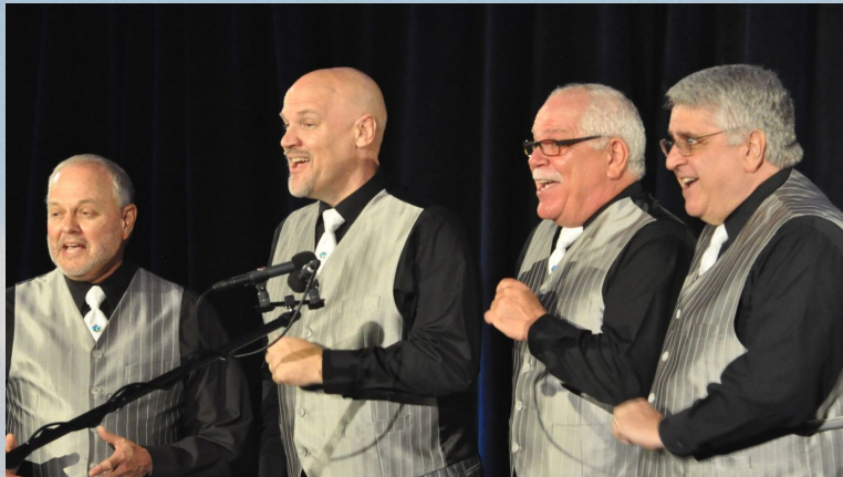
Easy Street. 2016 Sunshine District Senior Quartet Champion,