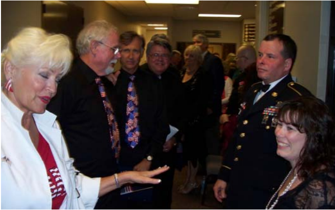
The Panama City Chapter, Barbershop Harmony Society, was honored to perform at the Warrior

Just to let you know we are few in numbers, still we remain active in the community and now have a very solid group of singers.