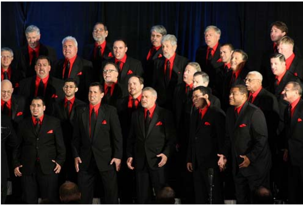
THX Chorus, Sunshine District Representative at the International Chorus contest next July