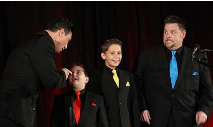
Would you call this, "ON THE JOB TRAINING"?