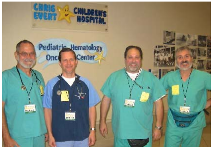
The quartet posing in front of CECH signage.

As Fall 2013 has come roaring in, so too has the Miami Chapter's new "Music Medics" program, a project meant to bring Barbershop singing to children's hospitals in Southern Florida. So far, three of the area's children's hospitals: Miami Children's, Chris Evert Children's and Joe DiMaggio Children's Hospitals have been the recipients of monthly visits by Miamians quartets and VLQs singing to their child patients, families and hospital staff. Hosted by the "Child Life" departments of these institutions, the Miamians Music Medics have been delighting the kids with their renditions of Disney classics and other children's songs.