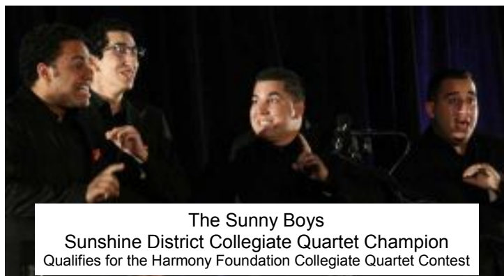
The Sunny Boys Sunshine District Collegiate Quartet Champion Qualifies for the Harmony Foundation Collegiate Quartet Contest