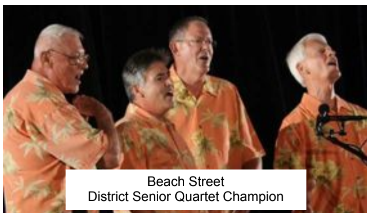
Beach Street District Senior Quartet Champion