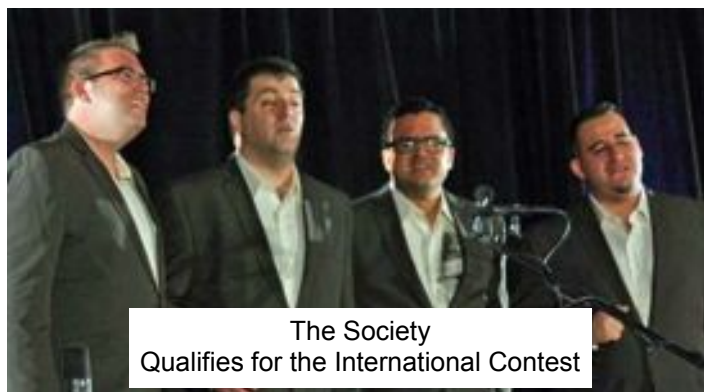
The Society Qualifies for the International Contest