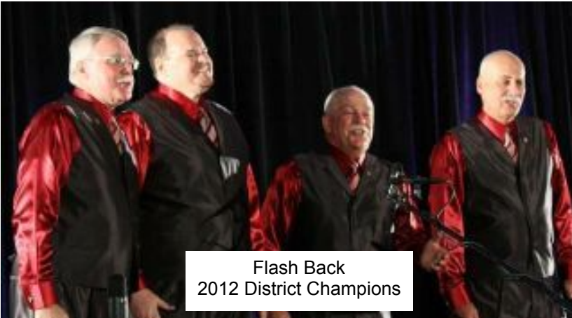
Flash Back 2012 District Champions