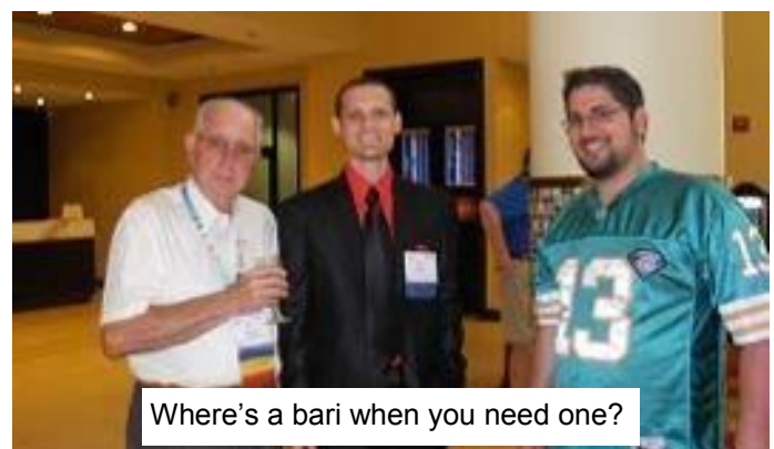
Where's a bari when you need one?