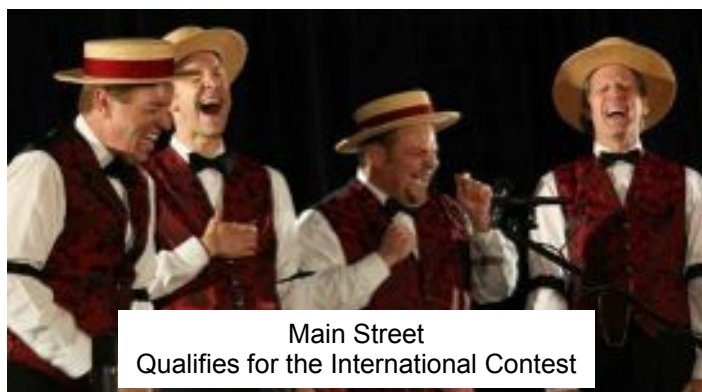
Main Street Qualifies for the International Contest