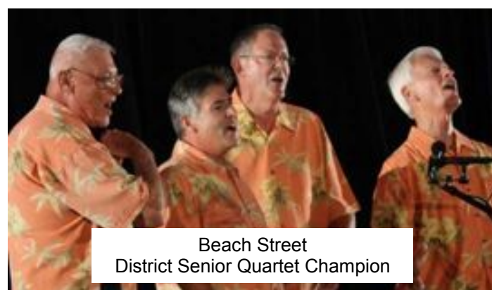
Beach Street District Senior Quartet Champion