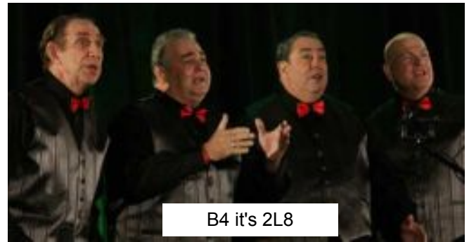
B4 it's 2L8