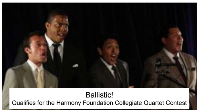
Ballistic! Qualifies for the Harmony Foundation Collegiate Quartet Contest