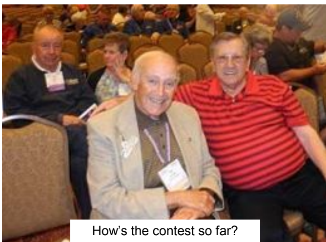
How's the contest so far?