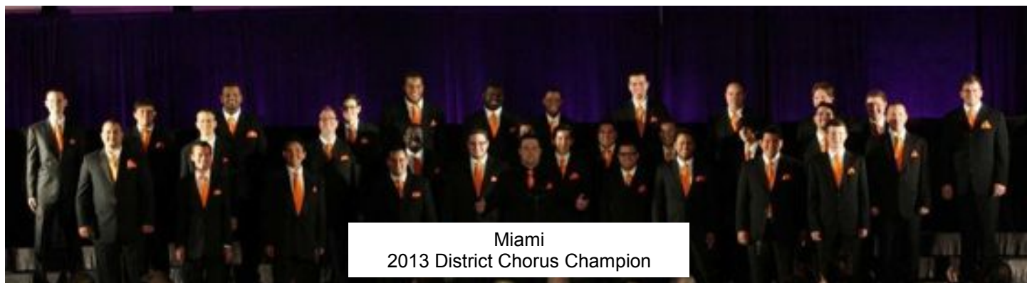
Miami 2013 District Chorus Champion