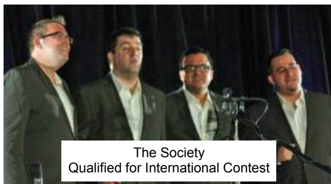
The Society Qualified for International Contest