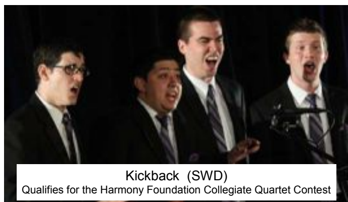
Kickback (SWD) Qualifies for the Harmony Foundation Collegiate Quartet Contest