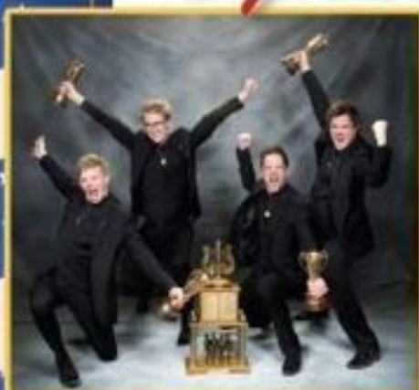
2012 International Quartet Champion here all the way from Sweden!