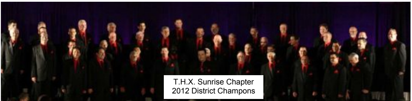
T.H.X. Sunrise Chapter 2012 District Champons