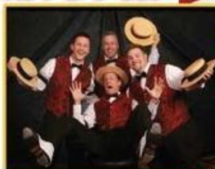
2012 International Medalists 2011 Sunshine District Champion