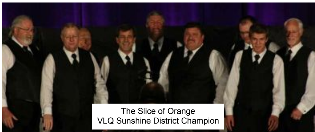
The Slice of Orange VLQ Sunshine District Champion