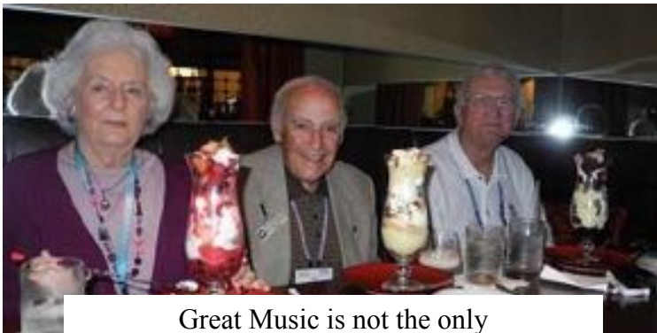
Great Music is not the only thing available at the Convention.