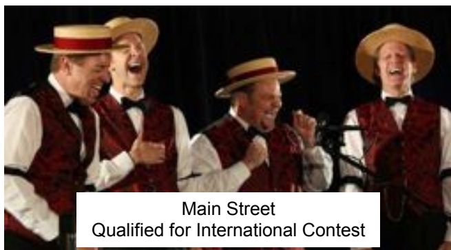
Main Street Qualified for International Contest