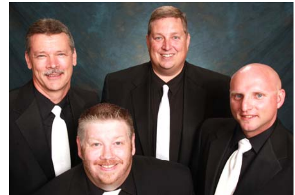
Monkey Business (D) 70.5