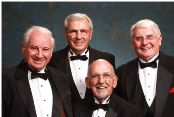
Seems Like Old Times (S) 55.2