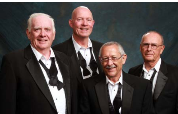
ALACRITY (D, S) 57.5