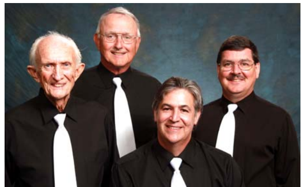
Sunsations (D) 56.8 Continued on page 9