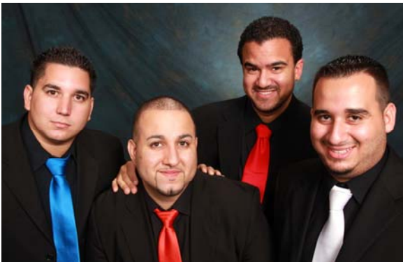
Spanglish (D) 74.9