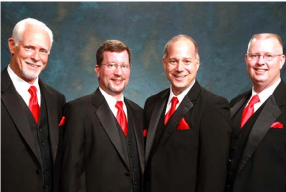
odd MAN out (D) 63.8