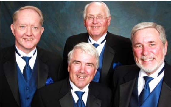
Sunset (D) 61.2