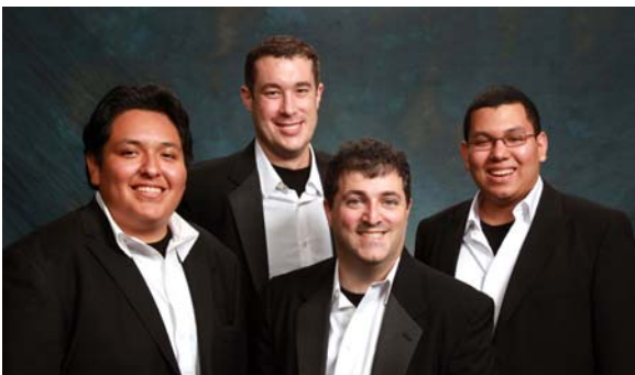
Everglades (D) 70.0