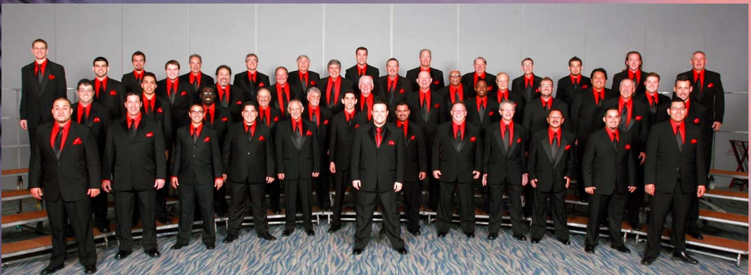
T.H.X. (Total Harmony Xperience) Sunshine District Chorus Champions