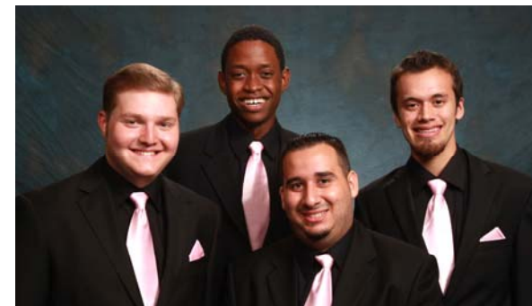
Click! (C) 69.2 Continued on page 8