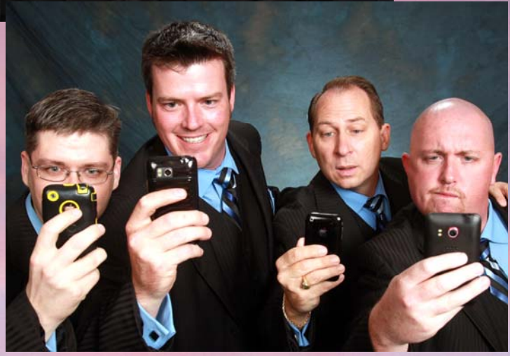
The PURSUIT 78.8