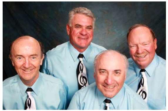
The 4 Sharps (D, S) 55.5