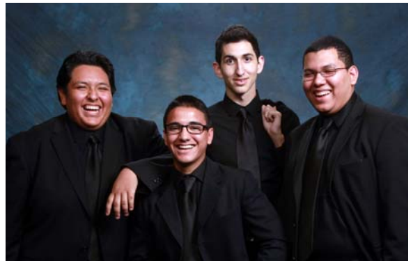
iQuartet (C) 74.7 Qualify for Collegiate Quartet Contest