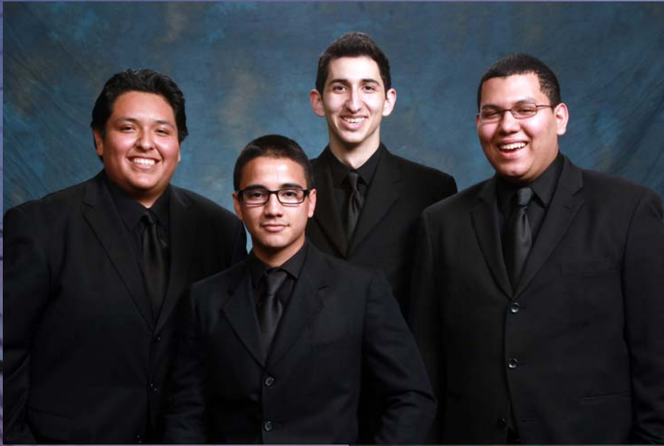
iQuartet Sunshine District Collegiate Quartet Champion Qualify for the Harmony Foundation Collegiate Quartet Contest in Portland

Competitor photos provided by Three Oaks Photography. Main Street photo on page 1 provided by Matt Bostick