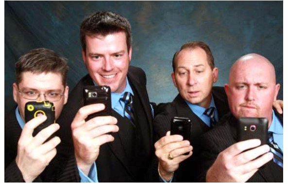
The PURSUIT (D) 78.8 Qualify for International Quartet Contest