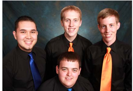
Live Gators (C) 60.8