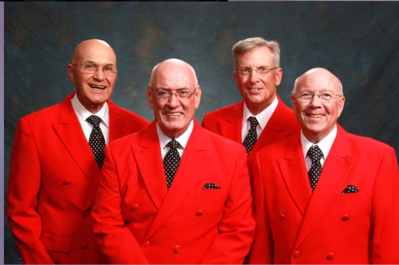
OLD GUYS RULE Sunshine District Seniors Quartet Champions