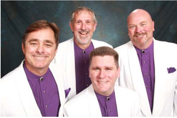
Easy Street (D) 68.7