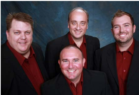
The Absolutes (D) 73.2