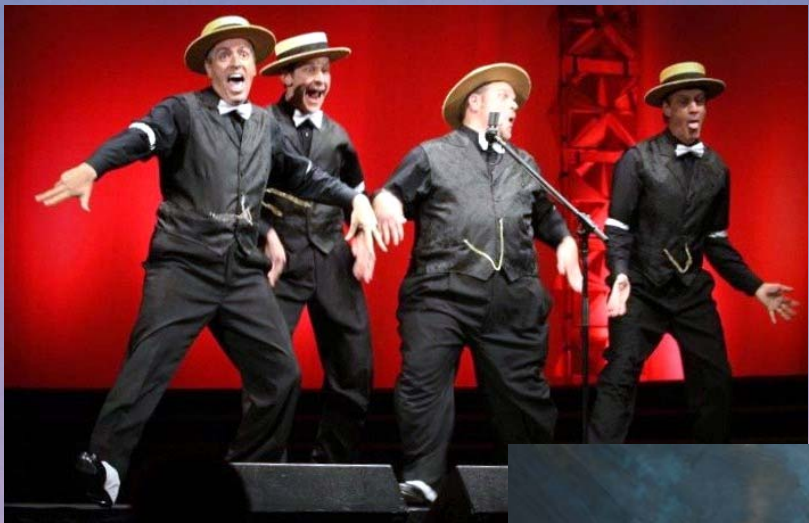
Main Street 88.5