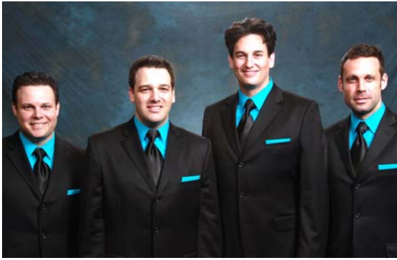
Throwback (D) 85.2 Qualify for International Quartet Contest