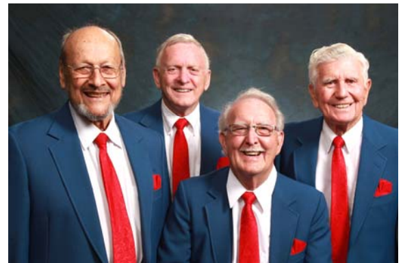
Toast to Harmony (S) 52.8