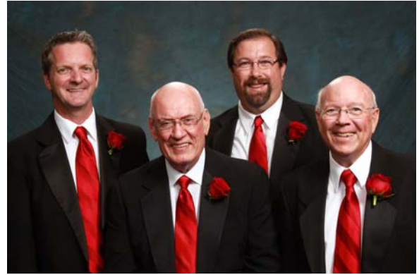
The Best of Times (D) 64.4