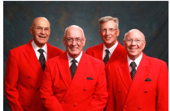
OLD GUYS RULE (S) 62.6 District Seniors Quartet Champions