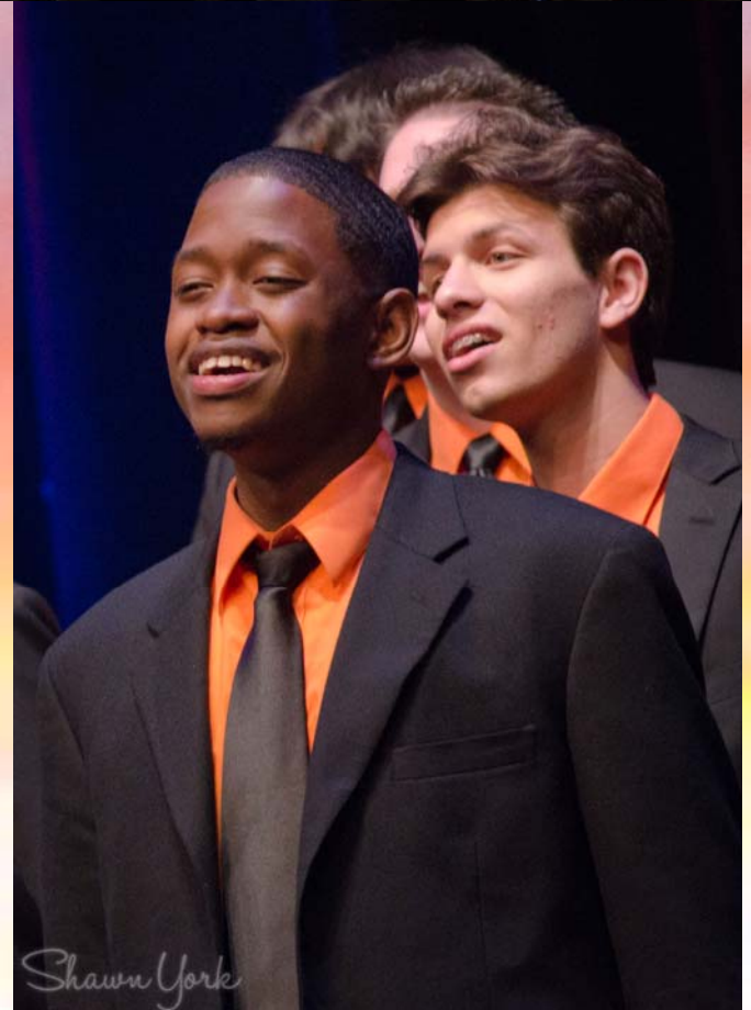
Action Photos from the International “Midwinter Seniors Quartet Contest” / “Youth Chorus Festival Contest”