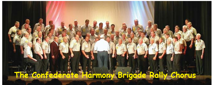
The Confederate Harmony Brigade Rally Chorus