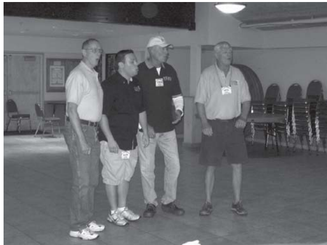
One of the free-for-all quartets performs

shop harmony sung by a kaleidoscope of quartets. The $210 we raised from the auction, though a worthy effort, did not compare with the joy and fun we had singing and listening to our barbershop brothers participating in quartet singing. Some sang in a quartet for the first time. Some