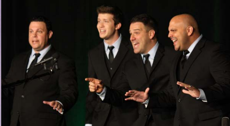
Throwback , 2014 Sunshine District Quartet Champion