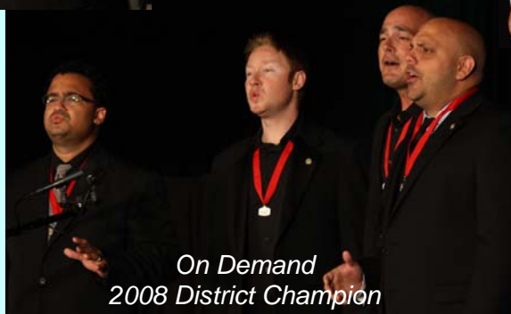
On Demand 2008 District Champion