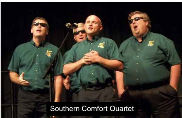
Southern Comfort Quartet