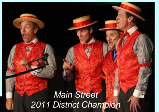
Main Street 2011 District Champion