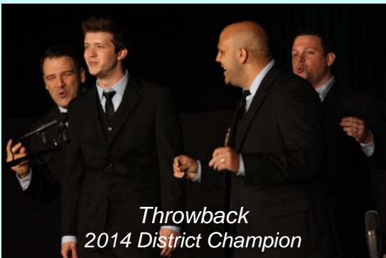
Throwback 2014 District Champion