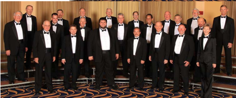
Left, Melbourne Harbor City Harmonizers 60.4