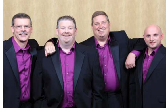
Monkey Business 69.8 Avg 4