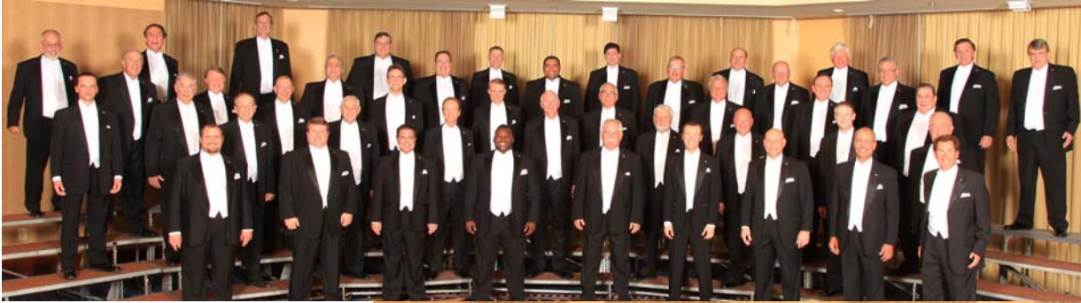
Top, Tampa Heralds of Harmony 78.5 District Chorus Champion District AAAA Champion