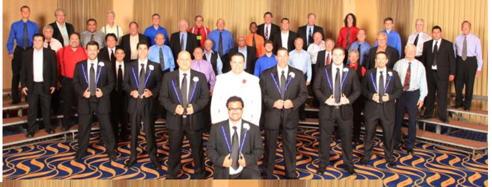
Right, Ft Lauderdale Sunshine Chordsmen 77.7