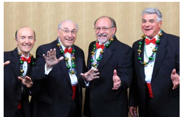
The 4 Sharps 57.0 Avg 9 S3