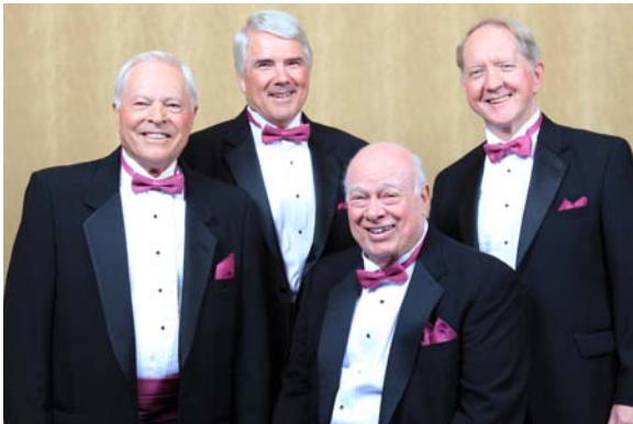
Afterthought 57.3 Avg 11 S5