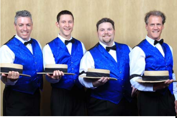
Main Street, Qualify for International Quartet Contest. 80.8 Avg 1