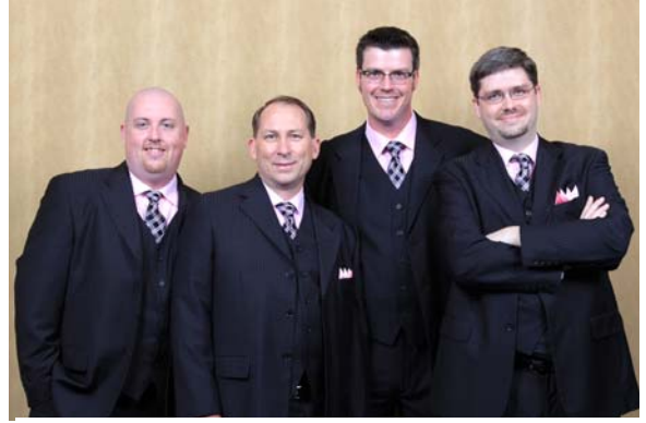
The PURSUIT, Qualify for International Quartet Contest. 80.7 Avg 2