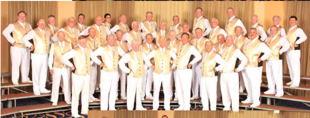
Left, Cape Coral Cape Chorale 62.0