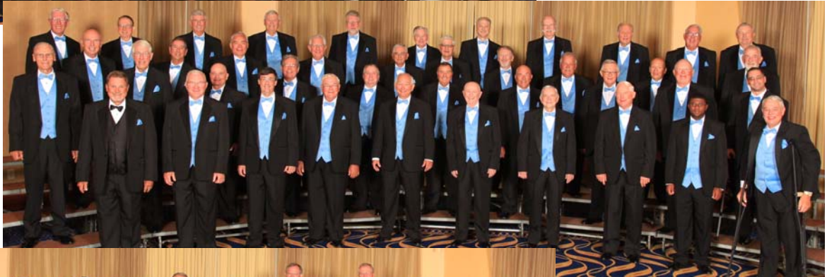
Below, Sebring Heartland Harmonizers 62.5