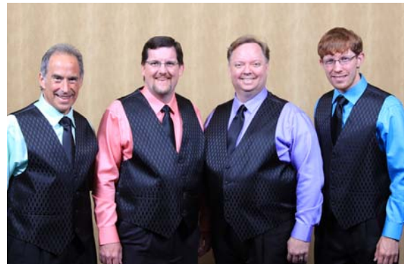
Gravity Tractor 66.8 Avg 6