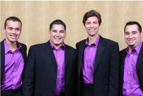
Click, Qualify for the Harmony Foundation Collegiate Quartet Contest. 73.0 Avg C2