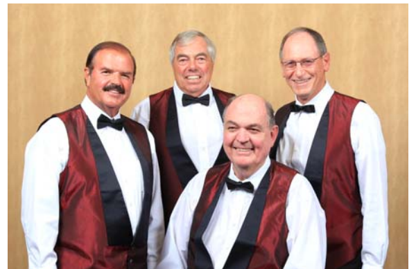
Sunny Boys 58.8 Avg S4