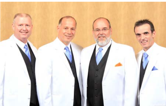
odd MAN out 68.7 Avg 5