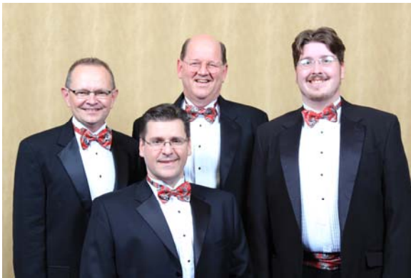
On The Szame Page 59.7 Avg 10