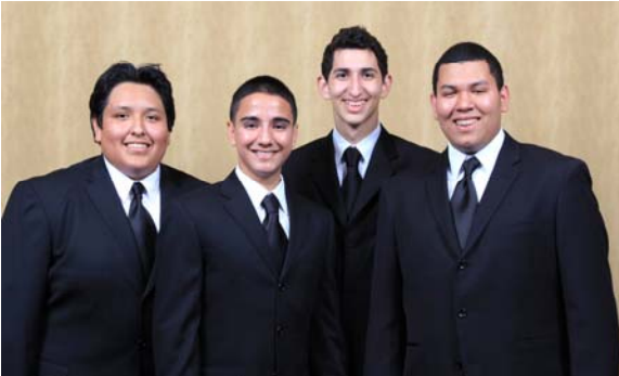
iQuartet, Sunshine District Collegiate Quartet Champion. Qualify for the Harmony Foundation Collegiate Quartet Contest. 78.3 Avg C1