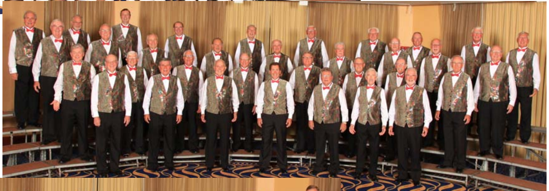
Below, Naples/Fort Myers Paradise Coastmen 61.6