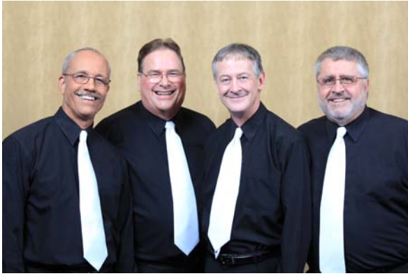
DOUBLE PLAY, District Seniors Quartet Champion 63.5 Avg 7 S1