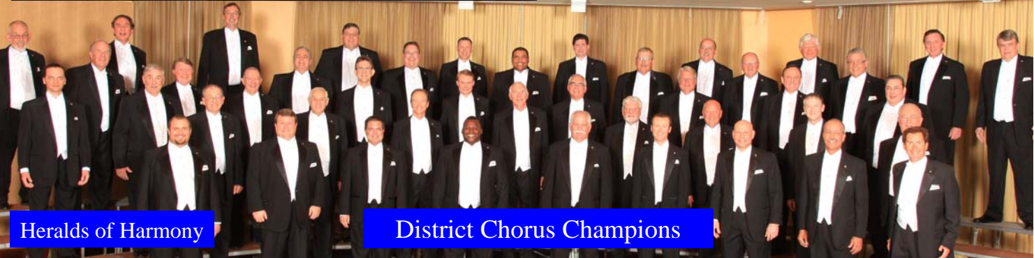
Heralds of Harmony