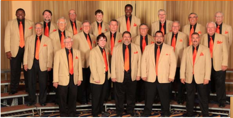
All Contest Photos by Three Oaks Photography