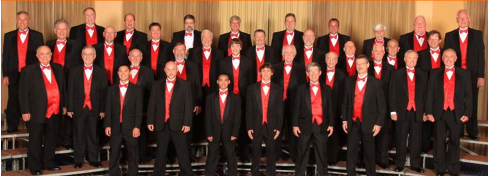
Left, Fort Walton Beach Emerald Coast Chorus 64.8