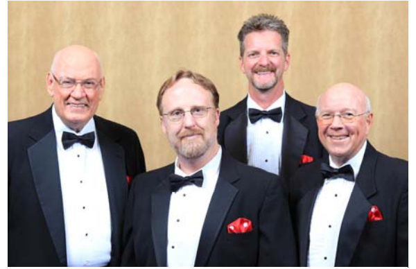
The Best Of Times 63.3 Avg 8