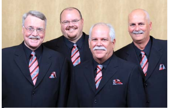
Flashback, Qualify for International Quartet Contest. 76.3 Avg 3