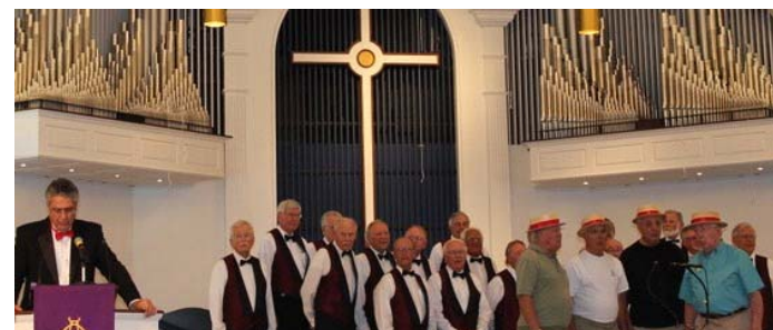
The Everglades Chorus's Timepiece Quartet opens the show with the theme song "Seems Like Old Times." They came on stage appearing to be the janitorial staff, causing the Martin/St. Lucie Mariners to wonder if there was a mistake.