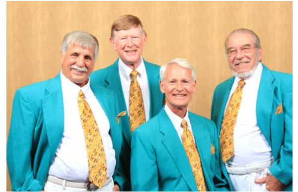
Tropical Blend 60.2 Avg S2