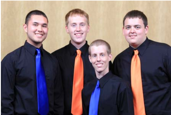
Live Gators 61.7 Avg C3