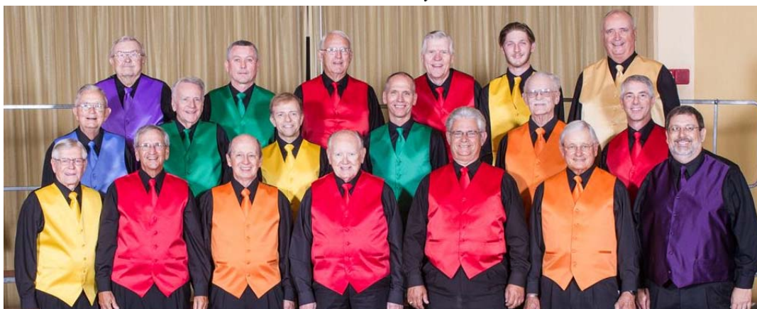
4. Winter Haven