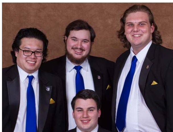
Flying By Paint