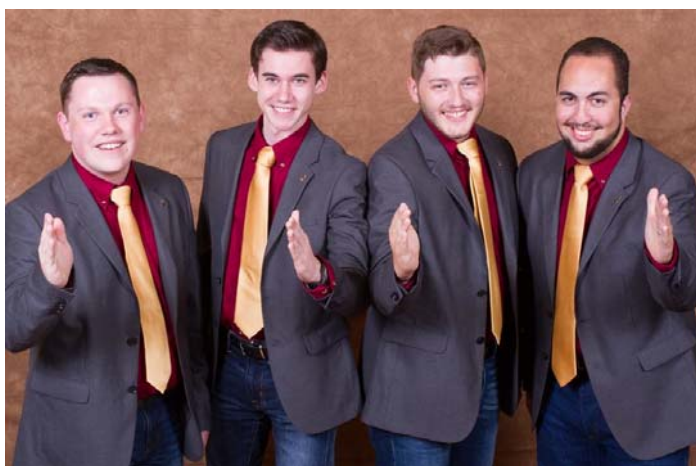
Nole Town Sound