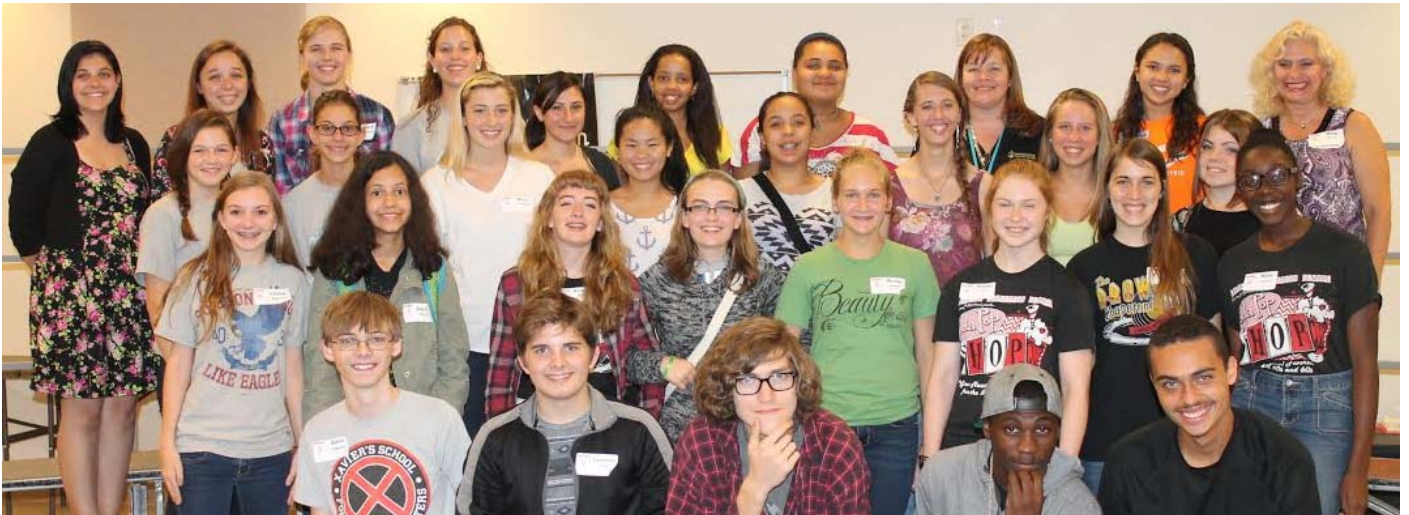
The High School students that attended Harmony Fireworks Sing Shop 2015