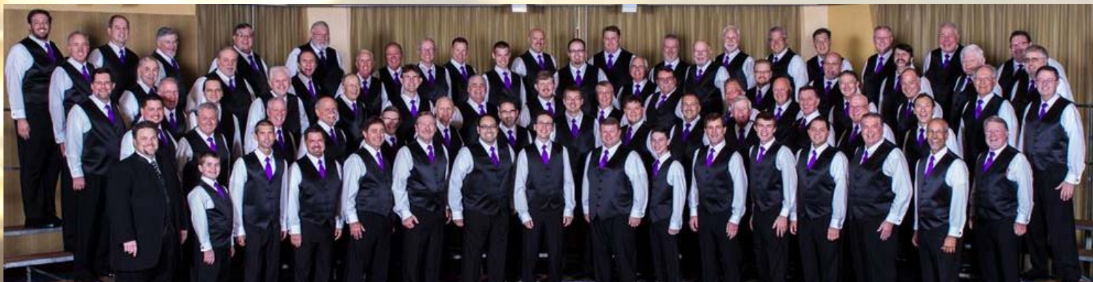
Jacksonville Big O 2015 District Chorus Champions