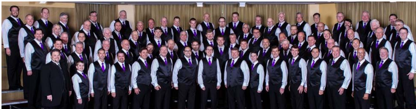
1. Jacksonville, District Chorus Champions and most Improved Chorus