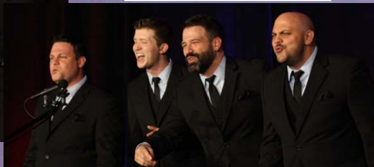
Throwback, Qualified out of District Qualified For International Quartet Contest