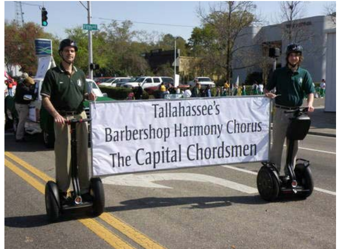
Springtime Parade: beats walking and you can bring your banner along.