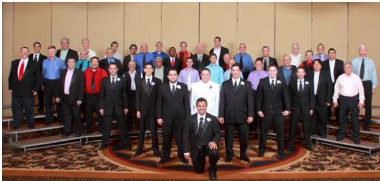
Fort Lauderdale Sunshine Chordsmen 937