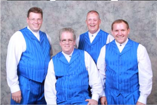
The G Men 1541