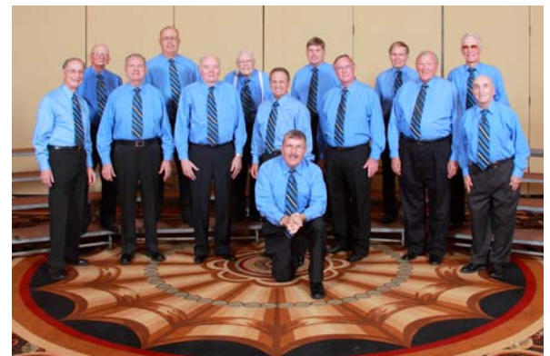
Citrus County Chorus of the Highlands 593 Sunshine District Plateau A Champion