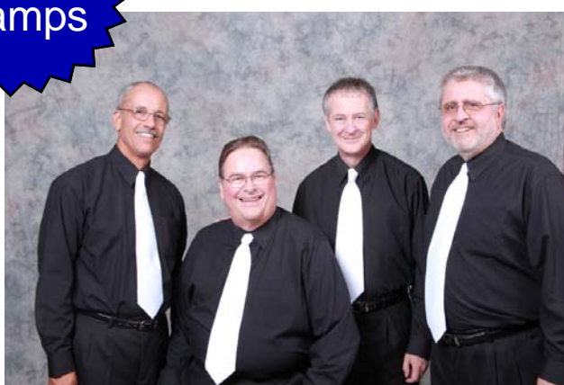
Sunshine's Representative DOUBLE PLAY at the International Seniors Convention in Las Vegas, January, 2011