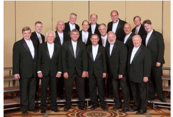
Winter Park Orlando Harmony 867 Sunshine District Plateau AAA Champion