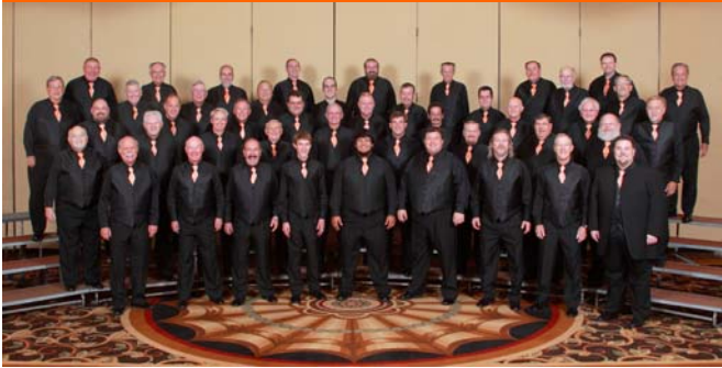
Jacksonville Big O 972 International Representative 2011 Sunshine District Plateau AAAA Champion