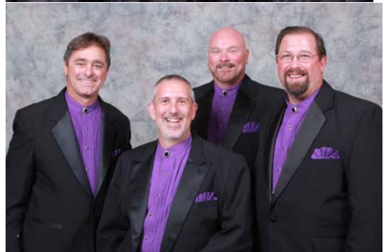
So Much More 1686