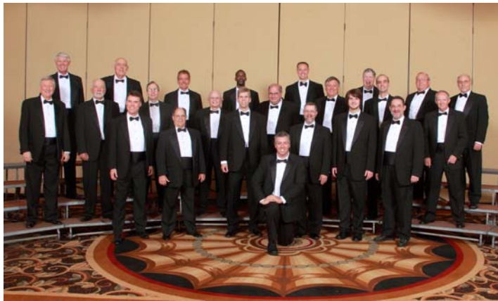
Tallahassee Capital Chordsmen 772 Sunshine District Most Improved