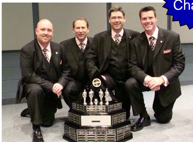
The 2010 Sunshine District Champions The PURSUIT