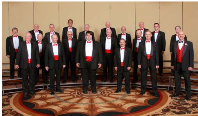
Melbourne Harbor City Harmonizers 652