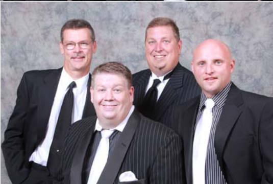
Monkey Business 1628