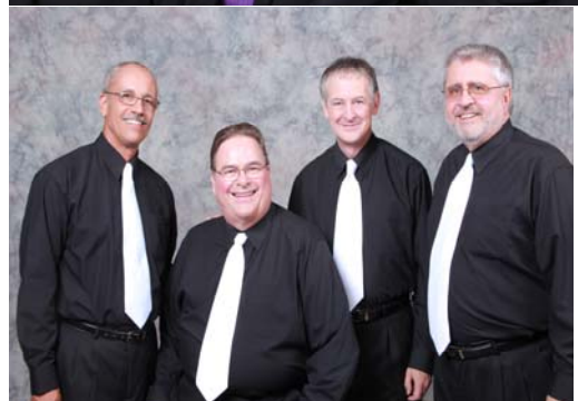
DOUBLE PLAY 1542 Sr. Quartet Reps. To Las Vegas