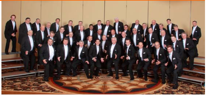
Tampa Heralds of Harmony 950 International Representative 2011