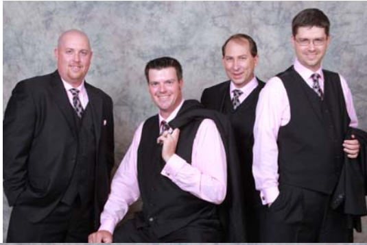
The PURSUIT 1903 Sunshine District Champions