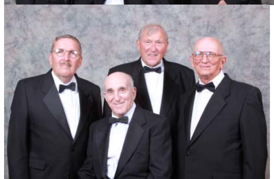
Aluminum Quartet 589