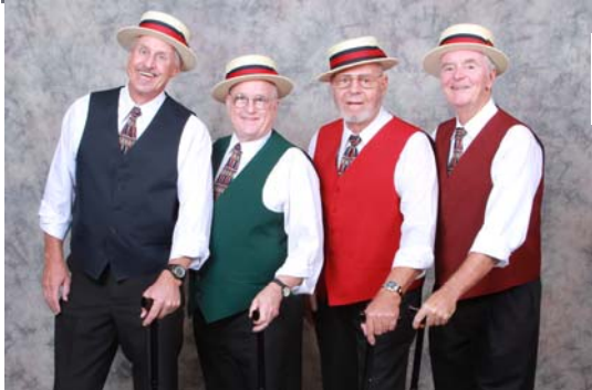
The Bowery Boys 698