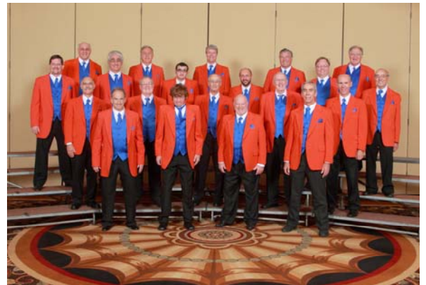
Gainesville Barbergators 742