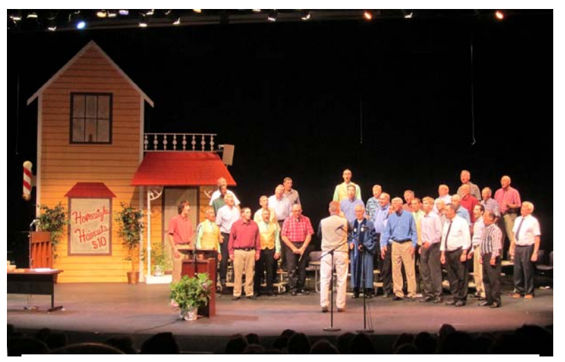
The Capital Chordsmen Show set and chorus