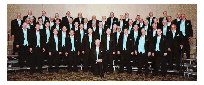
Savannah Center, The Villages, FL Saturday, December 4, 2010 at 7:00 PM.

Our featured guests will be the famous Ditchfield Family Singers and the quartet: My Three Sons.