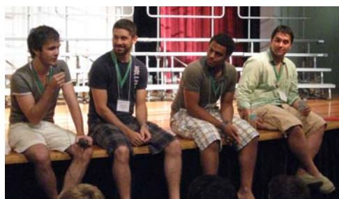
Prestige, our HX Teaching Quartet from Bowling Green, Ohio College