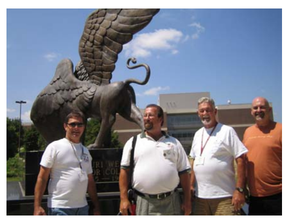
The Sunshine Boys Harmony U 2010