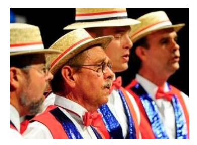
The Capital Chordsmen Bandwagon