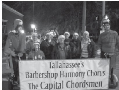
At the Winter Festival Parade

and walked along with a float we built for the Tallahassee Winter Festival