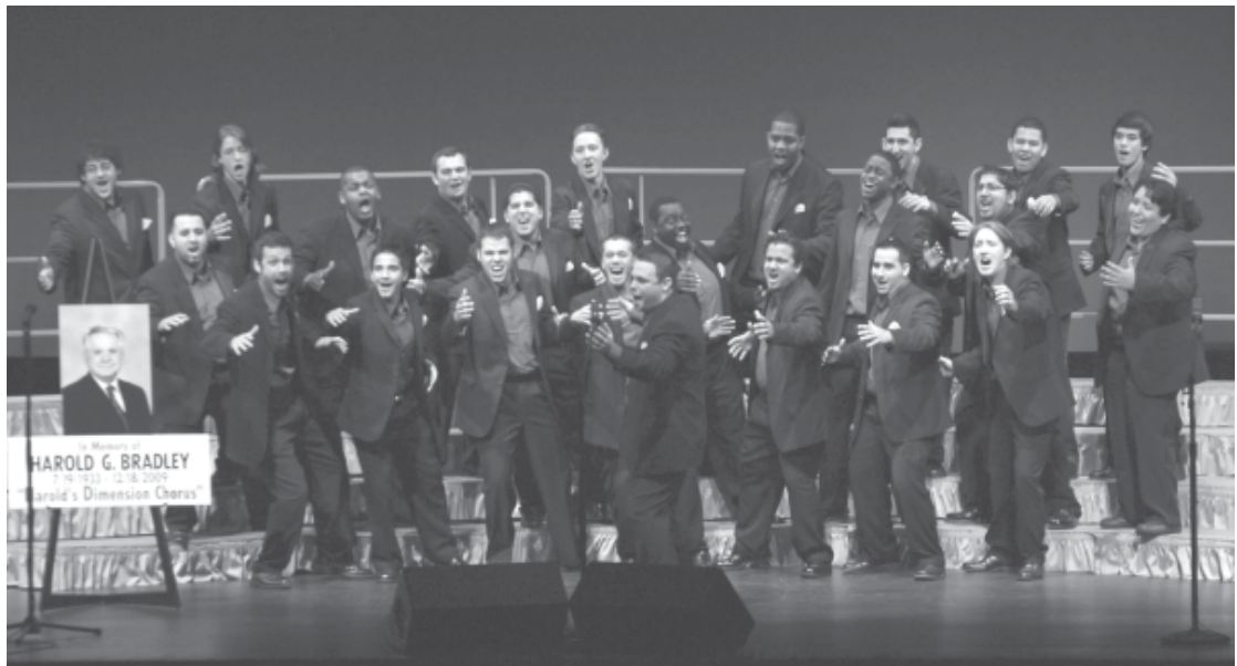
The HD Chorus in Competition