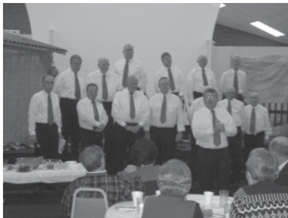
The Citrus Chorus Entertains

Citrus County barbershoppers from the Chorus of the Highlands chapter, prepared for the three days of Singing Valentines by performing in a large group for Wal-Mart , when they picked up their candy and Valentine's flowers. They sang in a large group for the employees and later added red vests for their quartet performances in the county, including a dinner for the Methodist Men and Spouse's Sweetheart dinner.