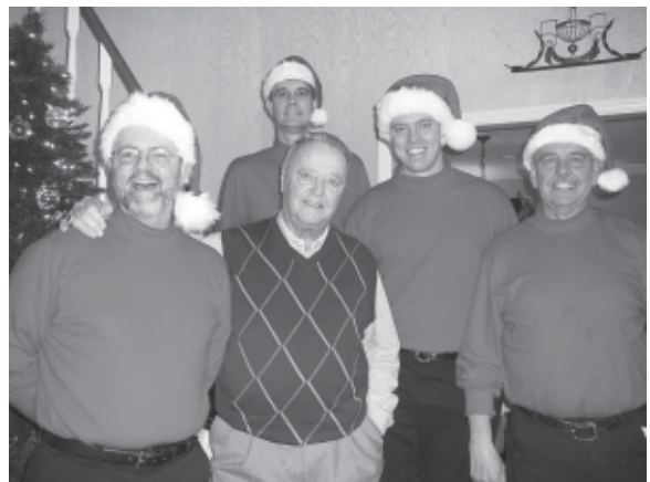
Coach Bowden & In_A_Chord

The large gathering of FSU coaches and friends and families enjoyed several songs sung by In-A-Chord. Apparently their rendition of Mr. Grinch did not hex the team, because two weeks later the Seminoles went on to win the Gator Bowl in convincing fashion over the much higher ranked West Virginia Mountaineers .